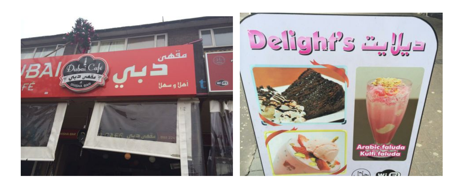
Appendix 15. Dessert Café