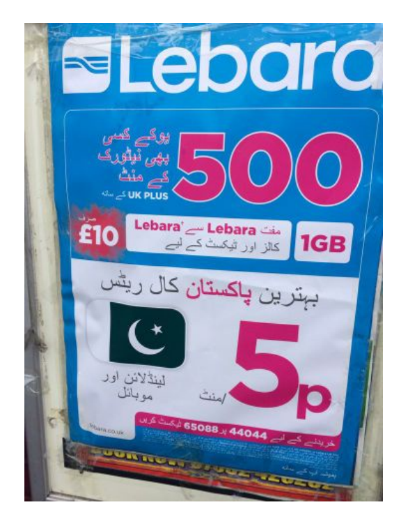
Appendix 11. Food Store