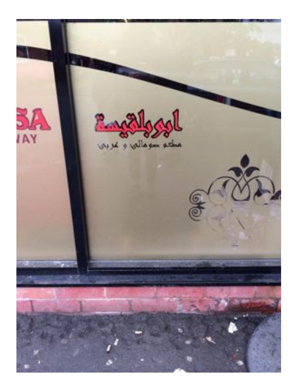
Appendix 44. Restaurant