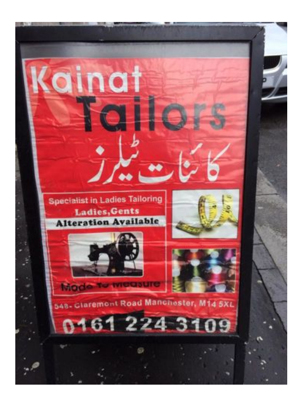
Appendix 41. Tailors