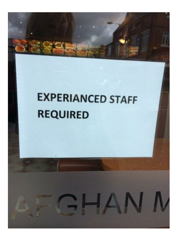
Appendix 6. Sandaf Takeaway