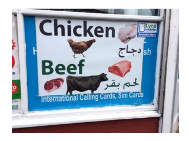
Appendix 42. Food shop