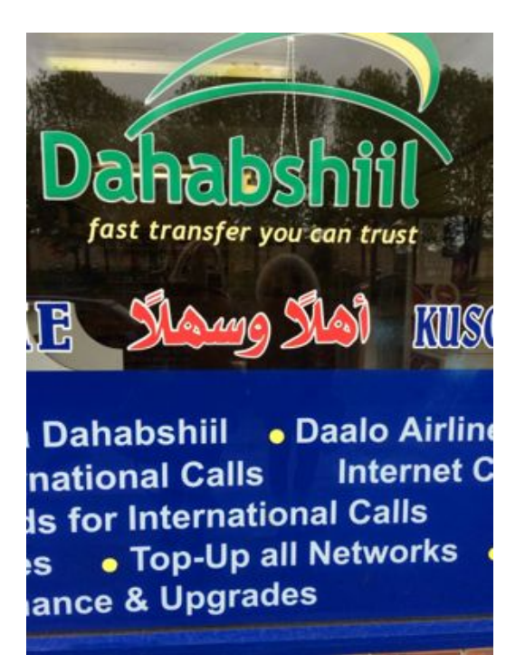
Appendix 43. Internet shop